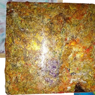
Panel from Multi Layer Plastics